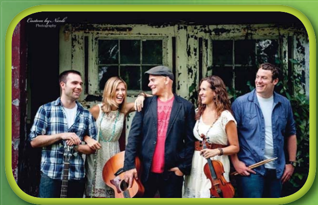
Live performance by headlining Americana Folk Rock, Emish!